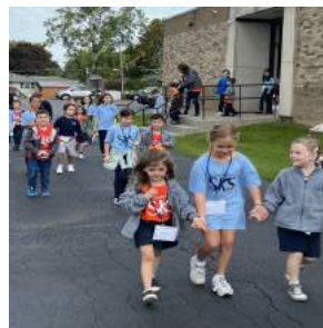
3rd graders walked with their kindergarten prayer Partners