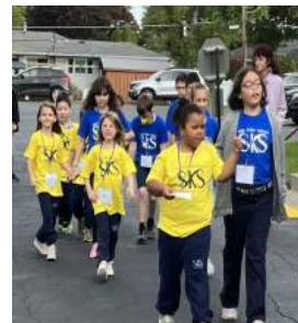
SKS 3 and 4 year old Preschoolers