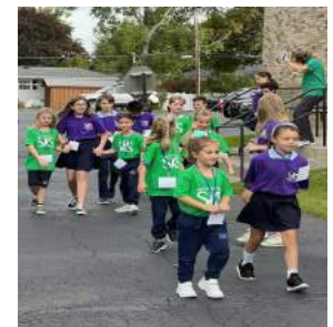
5th graders walked with their 2nd grade Prayer Partners

Website: saintkaterischool.org Facebook: @SKSIrondequoit Instagram: saintkaterischool